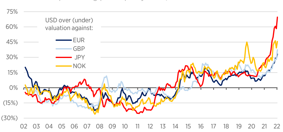
Lines show the deviation of each exchange rate from its fair value as implied by Orbis' purchasing power parity model.

Deviation from purchasing power parity value, US dollar vs selected currencies